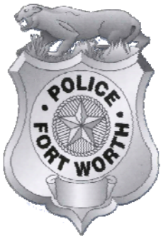
Issued June 9, 1912