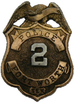
Circa late 1870s